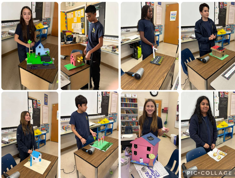
Electricity projects – We are all champions!

Social Studies: We will be a new unit that focuses on the First Nation Groups of early Canada