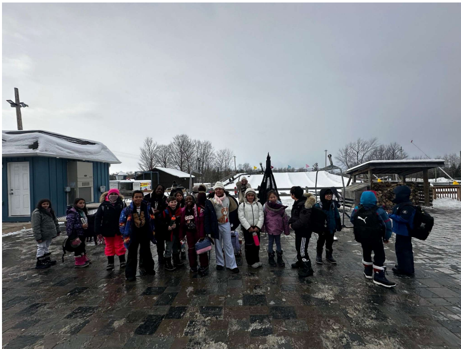
Fun at Snow Valley