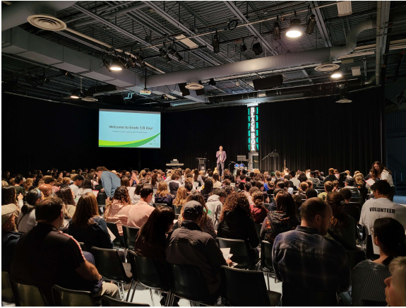
TD - Grade 7 & 8 day